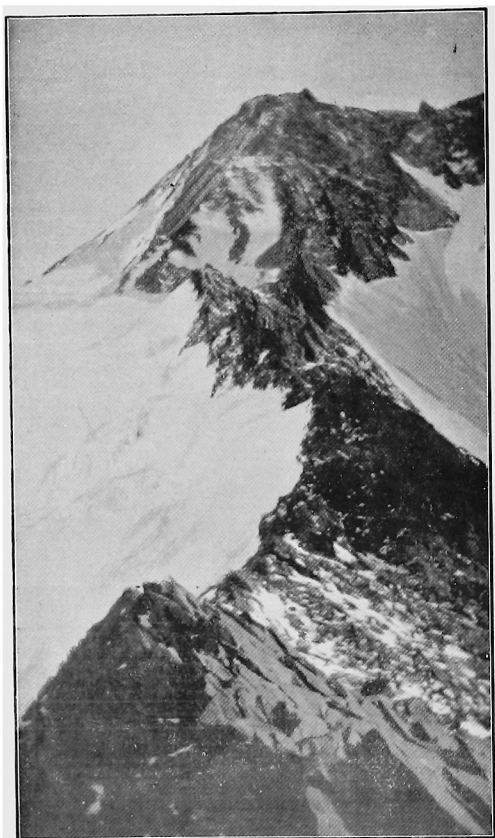
Finsteraarhorn from "breakfast place."