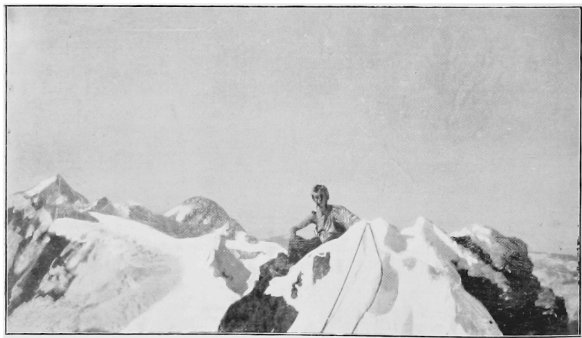
Summit of Finsteraarhorn. January 6, 1909.