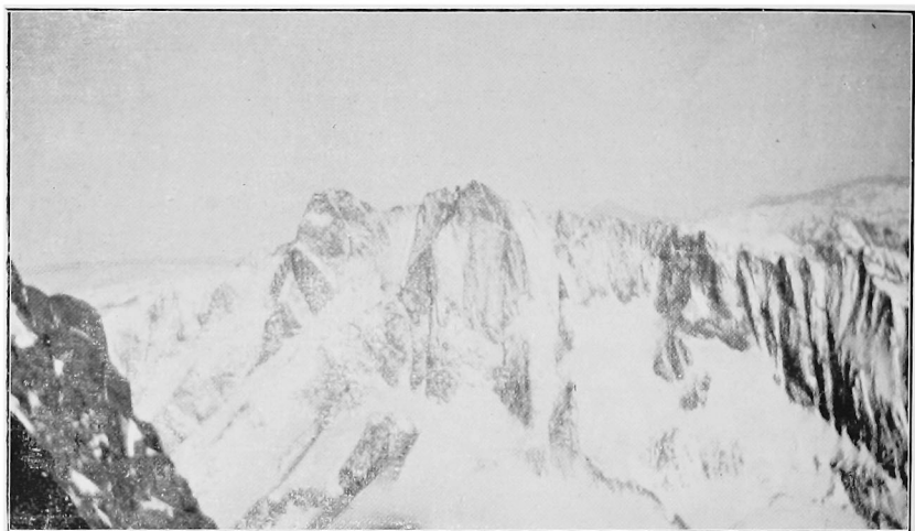
Shreckhorn from Finsteraarhorn.