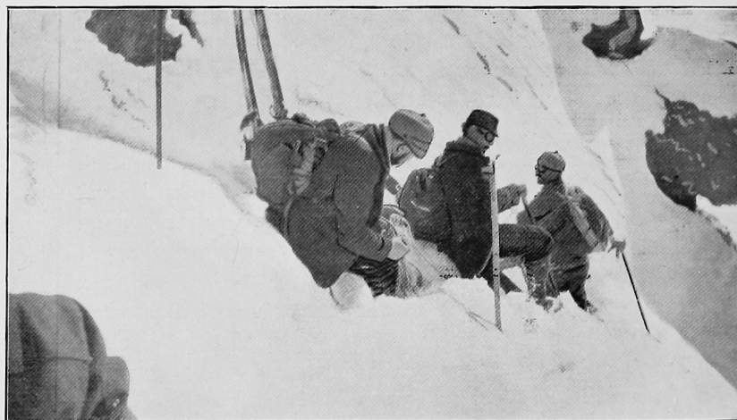
The Couloir on the Petersgrat.